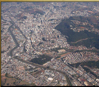
City of Juiz de Fora

Regarding our church building, we have experienced some delays. This is both positive and negative. On the positive side, it seems likely that we will be approved to have subsoil parking at our church, which is desperately needed. However, this will increase cost and delay the beginning of construction until sometime later this year. We do believe it is well worth the wait! Please continue to pray and stand with us as we endeavor to plant a gospel preaching church in this city of 550,000 souls.